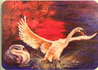
Swan in Water & Flight at Sunset by Debra Classen